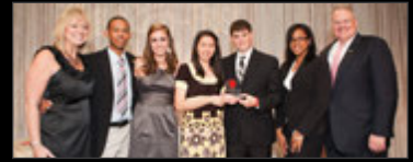
Y Street, a program that uses the Evolvment model, was named Group Youth Advocate of the Year in 2011 by the Campaign for Tobacco-Free Kids.

Each EVOLVEMENT campaign is custom-made to match a client's policy change objectives. The Rescue SCG team works with you to clarify the objectives and identify Measures of Progress that youth can work on to support your overall policy change effort.